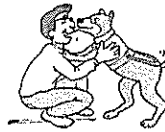
Loving pets—need special attention!

starts barking late into the night. Or when Fido digs holes in a neighbor's garden. Or when Spot starts spotting the common areas. That's when the community Association starts receiving complaints. How can you control pet problems? Or more accurately, how can you control problems caused by pet owners?